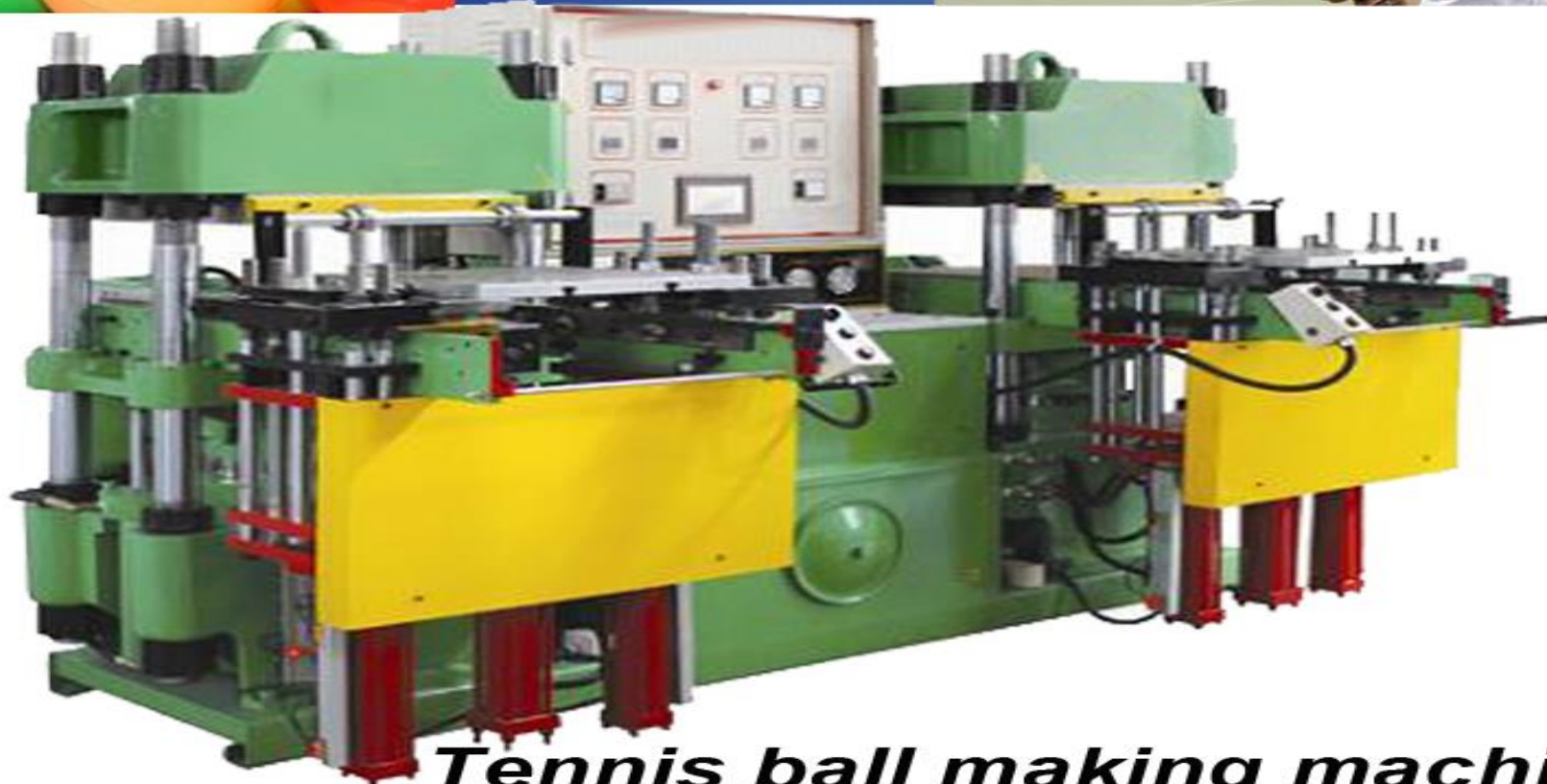
Tennis ball making machine